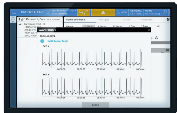
Smart central live waveforms view

The capability to view waveforms when away from the unit in near real time helps to streamline patient care whenever coordination with colleagues is required, to evaluate a patient's condition and decide on the best course of action. The automatic capture and syncing of waveform snapshots with events helps to provide valuable context to alerts, which supports alarm management workflow.